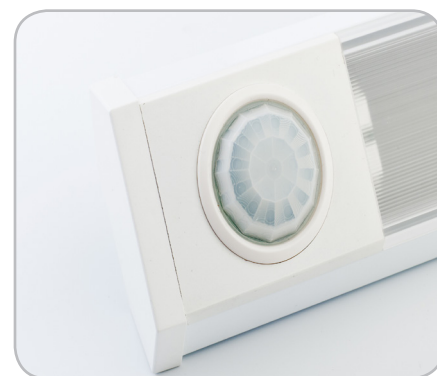
Motion detector as an accessory