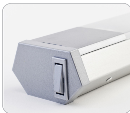
Separate switch as an accessory