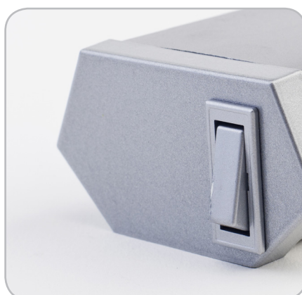
Separate switch as an accessory