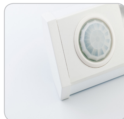
Motion detector as an accessory